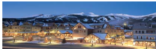
Hyatt Main Street Station at night